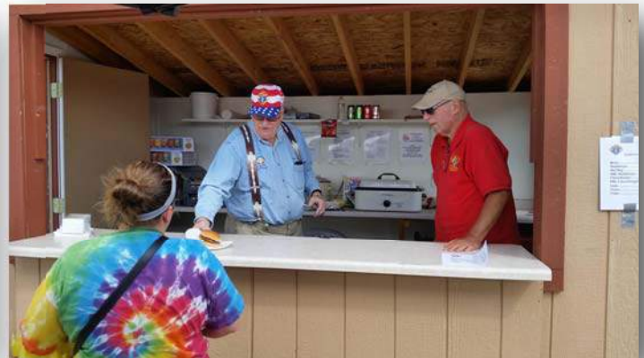
KC Brat-Fry at Piggy Wiggly September 4 Slinger, WI